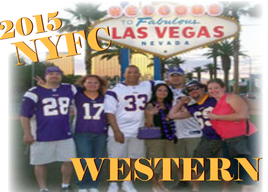
in a warm weather city in front of Be it shopping, shows or other activities, the glitz & glamour of Las Vegas makes for a great SNI to discuss the formulation of

Sports Network as Event Manager is not a "league". While we do often work with local leagues to encourage their entry and get them involved in the NYFC to benefit their program, all teams who attend the NYFC get fair and equal treatment, both on and off the field!