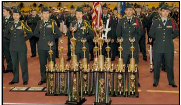
U.S. Army Cadet Command Eastern Division Armed & Unarmed Champion Francis Lewis HS from Fresh Meadows, New York stand behind the fortress of trophies earned at the event. Their margin of victory was unprecedented with so many good schools attending.

The battle for Division Runner-up honors was a three horse race that came down to the wire. McNair Academic HS from Jersey City, New Jersey looked very strong. When the dust settled, the Tanko-Woosas drill team experienced a deja vu finish by repeating their 2006 Division Runner-up placement by AGAIN gaining four trophy finishes with a single 6 th place finish (this time in Exhibition) just as they had done the previous year! They needed every point as both T.C. Williams HS from Alexandria, Virginia and Long Island City HS from Long Island City, New York were in hot pursuit, with both teams earning four team trophies in their own right to clean up virtually all of the top finishing trophies between them!