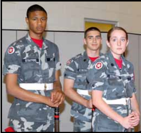
Members of the Stratford Knights drill team from Stratford HS in Goose Creek, South Carolina scope out the the Armed Exhibition drill area before they dazzled the judges and took home a well-deserved 3rd place trophy.

Just a few miles north of the often referred to "Shining City on the Hill," over 40 Army Junior ROTC programs descended on Landover, Maryland to participate in the largest single-day, Army-only championship competition in the world. Schools from Rhode Island to Florida and all points in between put months of training