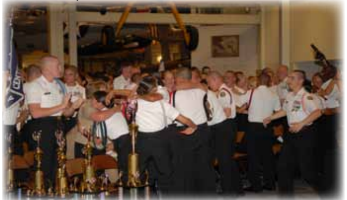
Centennial HS from Las Vegas, Nevada erupted into a mass display of unbridled emotion as they learned they had just clinched their second consecutive Overall Championship at the 2010 Navy Nationals competition.

So the question is thrown - can Centennial hold on once more to solidify themselves as a true NJROTC dynasty? Don't bet against it! Secure yourself a spot at the 2011 Navy Nationals to watch the newest drama unfold for yourself - it should be another amazing, wild ride!